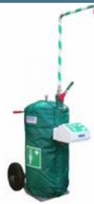
Mobile self-contained safety shower with eye wash and insulated jacket -