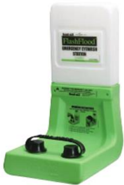
Fendall Flash Food