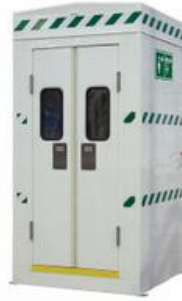
Polar safety shower within insulated cubicle