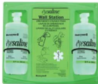
Eyesaline Wall Station