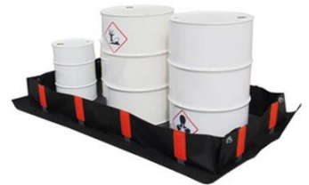
Drum Containment Bund