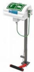
Pedestal mounted eye wash with GRP closed bowl