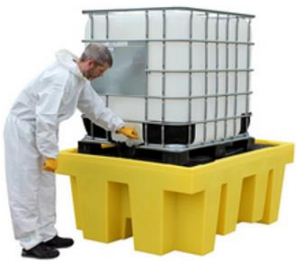
IBC Spill Pallet