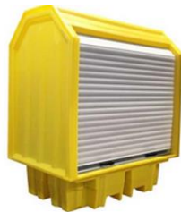
Hard Covered Spill Pallet