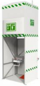
1500L tank fed safety shower - immersion heated