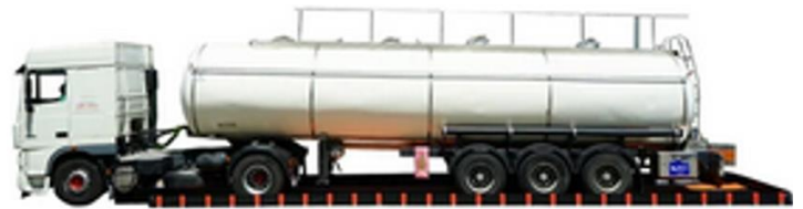
Vehicle & Equipment Bund Liner