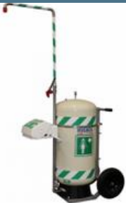
Mobile self-contained safety shower with eye wash - 114 litre