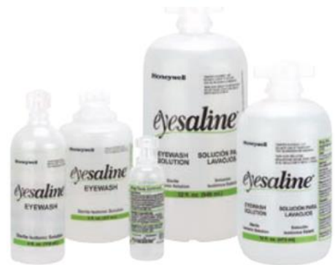
Eyesaline Eyewash Bottles