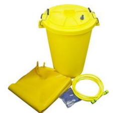
Ceiling Leak Diverter