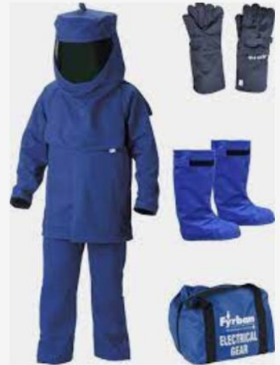
Arc Flash Electric Suit