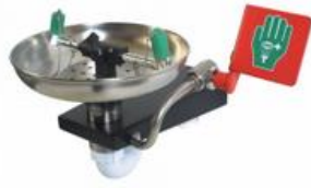
Wall mounted stainless steel open bowl eye wash