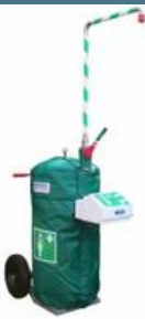
Mobile self-contained safety shower with eye wash and heated jacket -