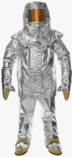
Heat Protective Suit