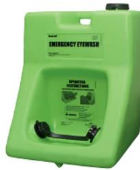
Fendall Porta Stream II + III