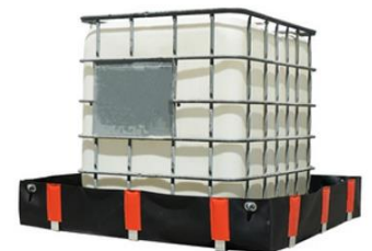
IBC Containment Bund