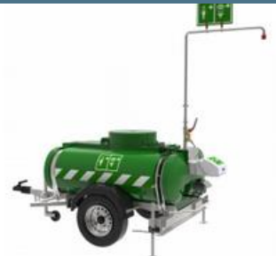
Mobile self-contained heated safety shower - 1200 litre