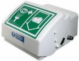
Wall mounted ABS closed bowl eye wash