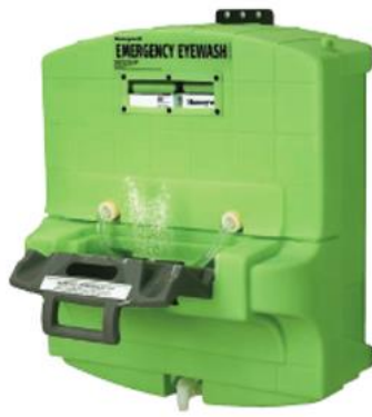
Fendall Pure Flow 1000