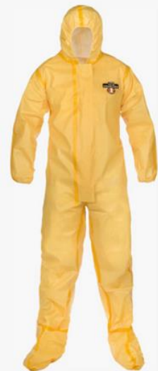
Sealed Seam Coverall