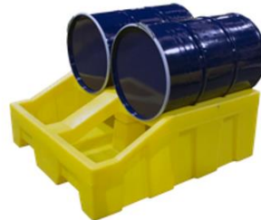
Horizontal Spill Pallet