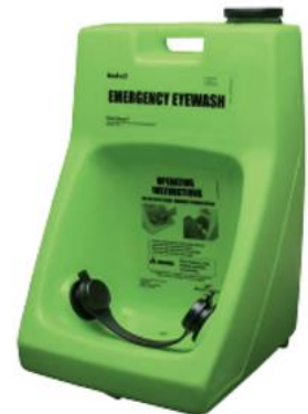
Fendall Porta Stream I