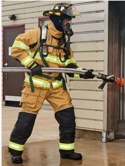
Fire Protective Suit