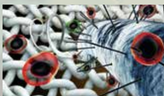
In this magnified view, the positively charged surface of MicroGard® attracts the negative charged bacteria. Due to the electrical attraction, the bacteria is drawn into the molecular spikes which puncture the bacteria membrane, eliminating it.